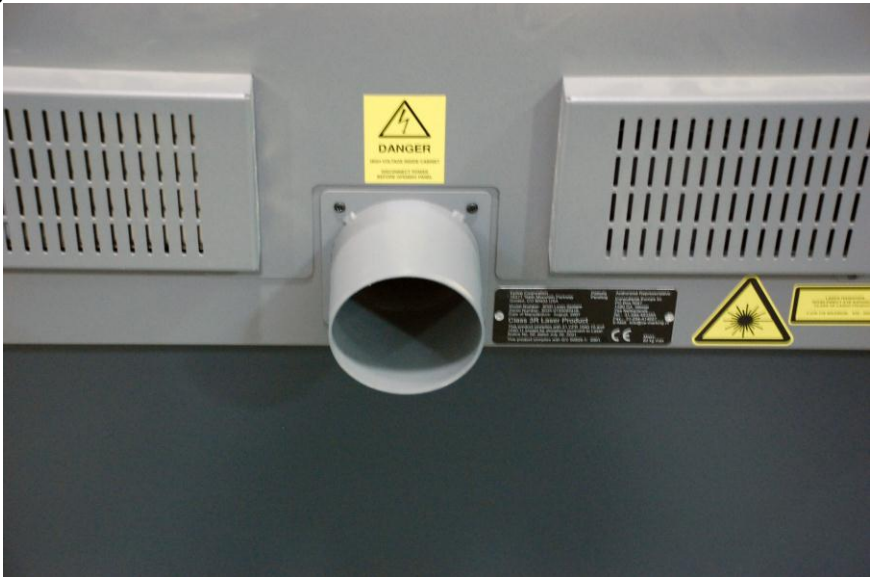
Exhaust port hookup located at the back of the machine.

Your laser system will have an exhaust port that is usually located at the back of the machine. This port will be connected to the inlet side of your exhaust blower using flexible aluminum or galvanized sheet metal ducting. Then, connect the exhaust side of the exhaust fan to the metal duct leading outside.